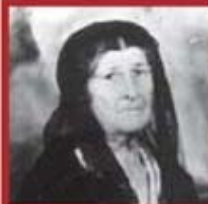
"Connecting Our Families"