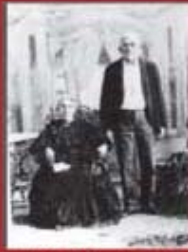
The Study Of Genealogy Page 7