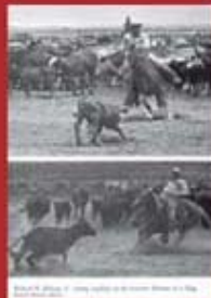
Los Kinenos of The King Ranch Page 6